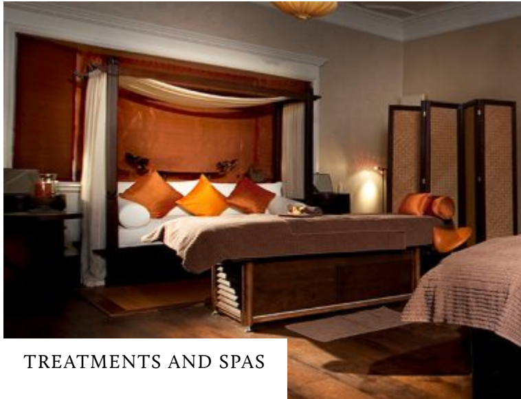
TREATMENTS AND SPAS

Quirky interiors and first class facials