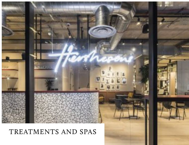
TREATMENTS AND SPAS