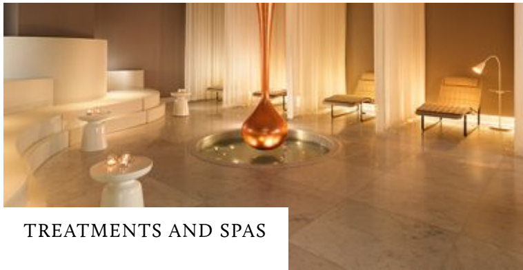
TREATMENTS AND SPAS