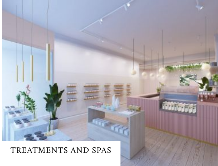
TREATMENTS AND SPAS